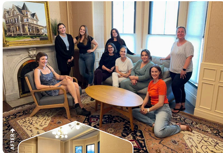
UMBRELLA STAFF IN THE NEW COMMUNITY ROOM AT 1330 MAIN STREET.